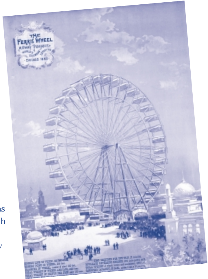
Poster advertising the Ferris Wheel

1 What rides have you been on? What rides would you like to go on?