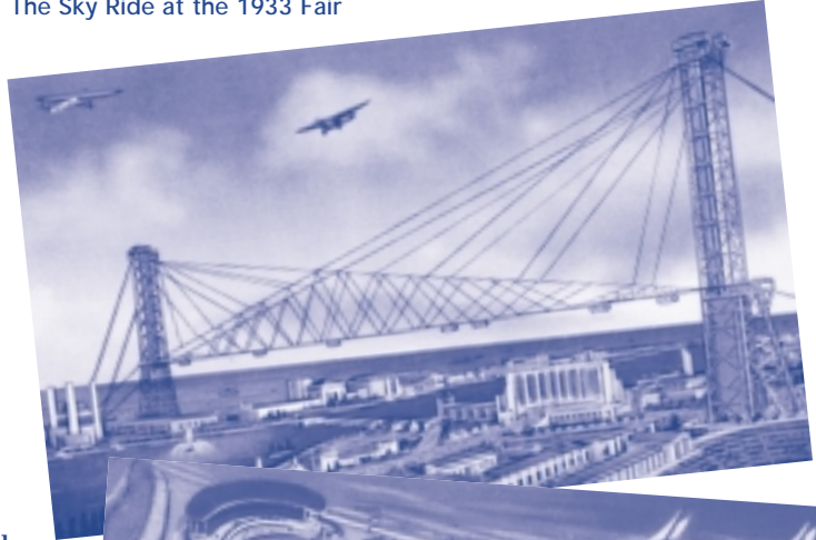
The Sky Ride at the 1933 Fair

Well, my grandpa went on the Ferris Wheel and now I have gone on the Sky Ride. I think I am very lucky. Now maybe I can get some sleep.