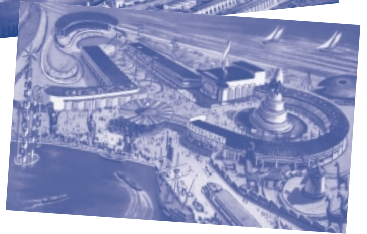
Enchanted Island at the 1933 Fair

2 If you could travel back in time, would you want to visit the fair with the Ferris Wheel or the fair with the Sky Ride?