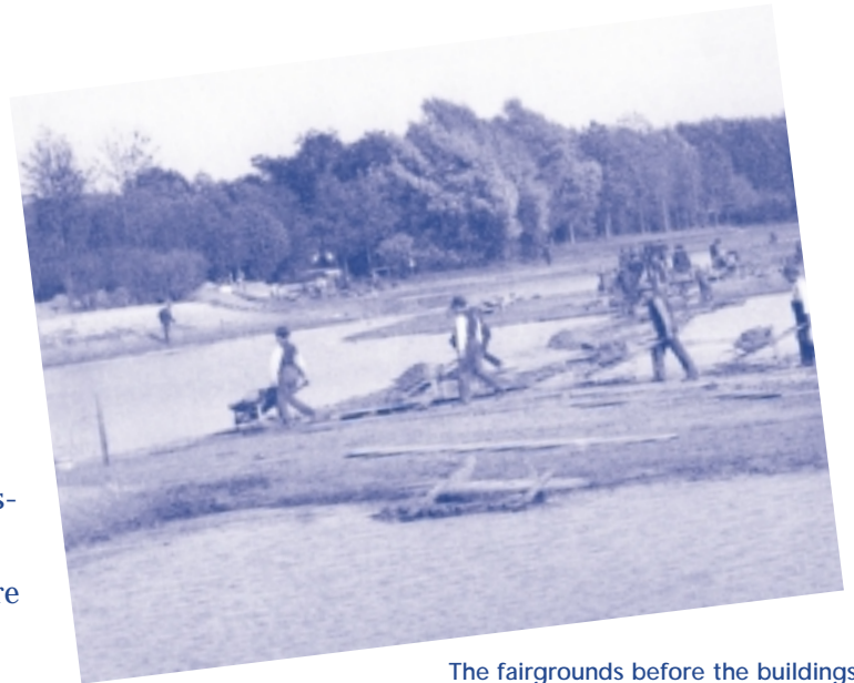
The fairgrounds before the buildings for the 1893 fair were built

Because I have only been to a carnival, I asked Grandpa what makes a world's fair a world's fair. He told me that there are exhibits about all sorts of things and about all sorts of people from around the world. He said that it took two years to make all the buildings for the exhibits. The buildings were not made from bricks and iron, but out of a kind of plaster called staff. All the buildings were painted white, so the fair was given the nickname the White City. He said the