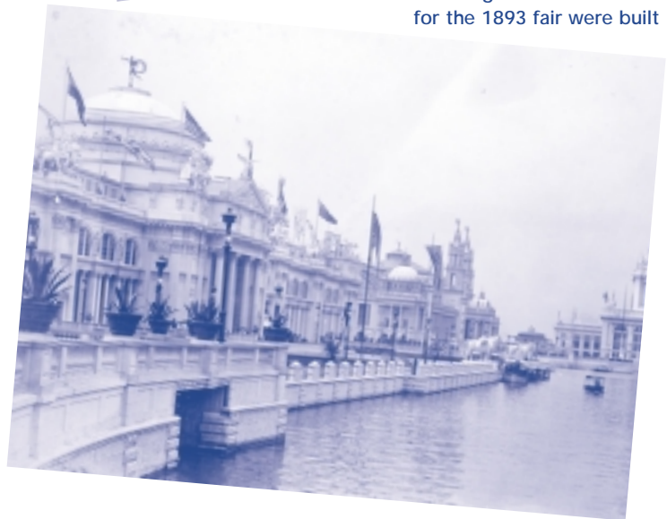
A completed building for the World's Columbian Exposition